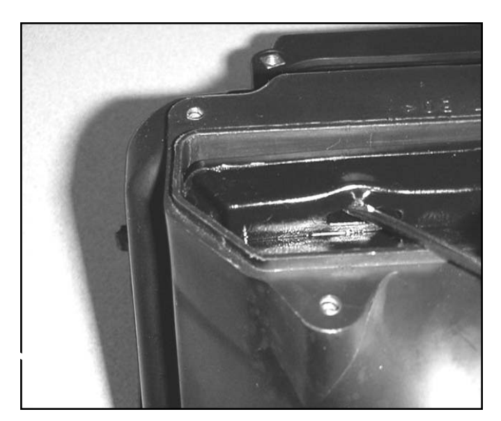
Fig. 1 Fig. 2