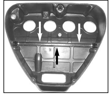
Fig. 1 Fig. 2 Fig. 3